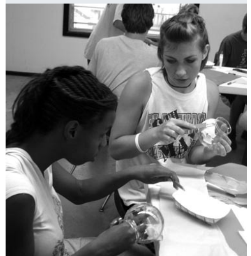
Campers create crafts at the 2007 Oklahomans Without Limits (OWL) summer camp. OWL camp, which takes place at the Central Oklahoma Christian camp in Guthrie, Okla., is designed to improve self-esteem and provoke positive social interaction among disabled and non-disabled peers.

For more information, please call 405. 232.4664 or visit www.olb.org .